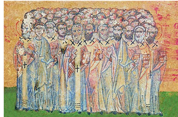
Seventy Disciples, anonymous artist, from a 15 th century Greek manuscript.