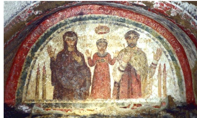
"Fresco in the Catacomb of San Gennaro, Naples, Italy - 2 nd or 3 rd century"